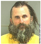
Brian David Mitchell