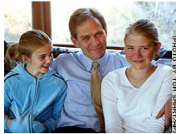
Mary Katherine, Ed, and Elizabeth Smart